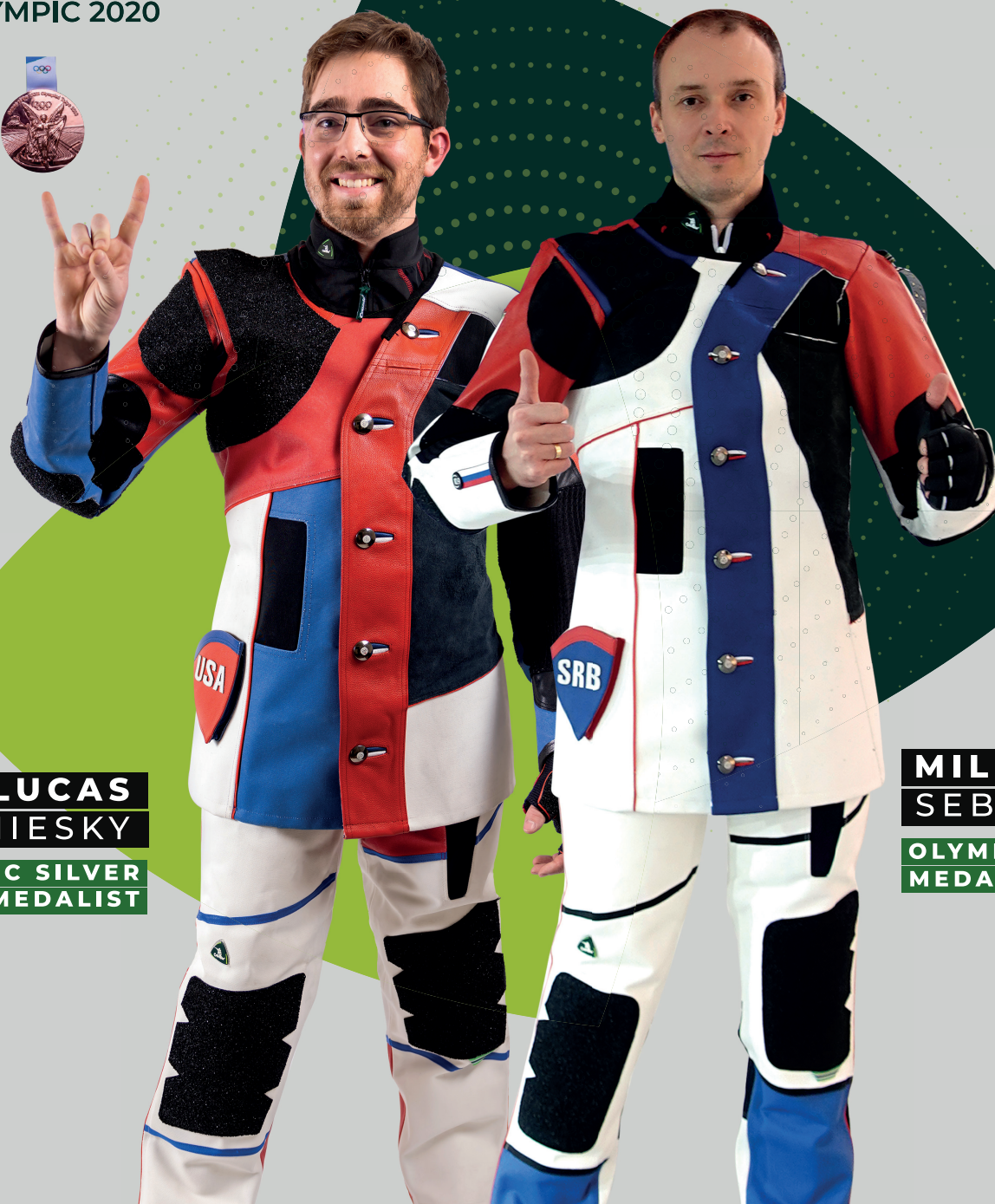
LUCAS KOZENIESKY OLYMPIC SILVER MEDALIST